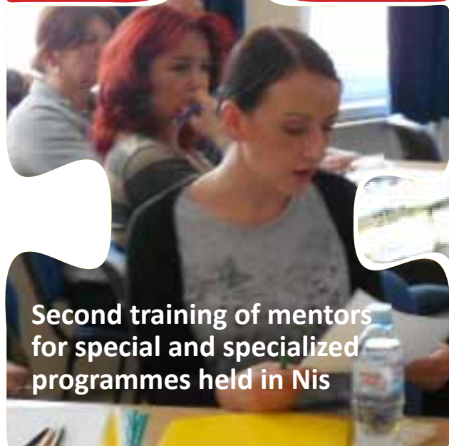
Second training of mentors for special and specialized programmes held in Nis

Project is implemented by SOFRECO and its partners Early Years and Internationaler Bund. Activities started in February 2011 and will continue until January 2014.