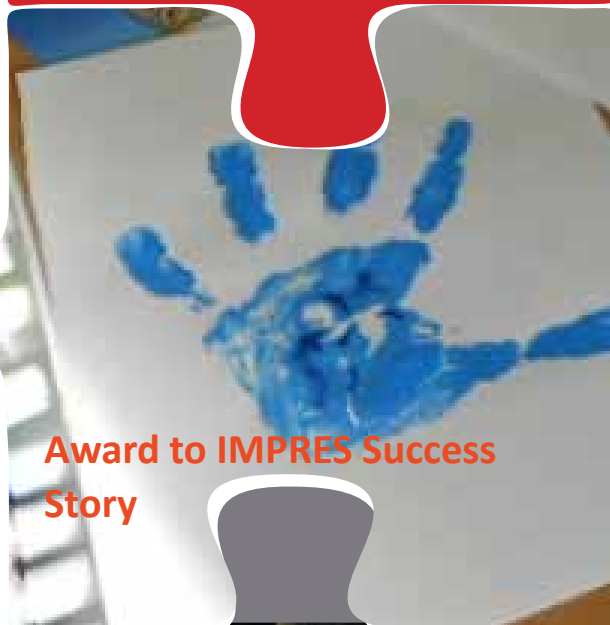
Award to IMPRES Success Story