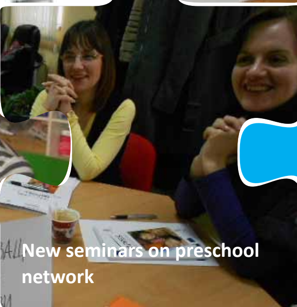
New seminars on preschool network

You can find more information about the project on