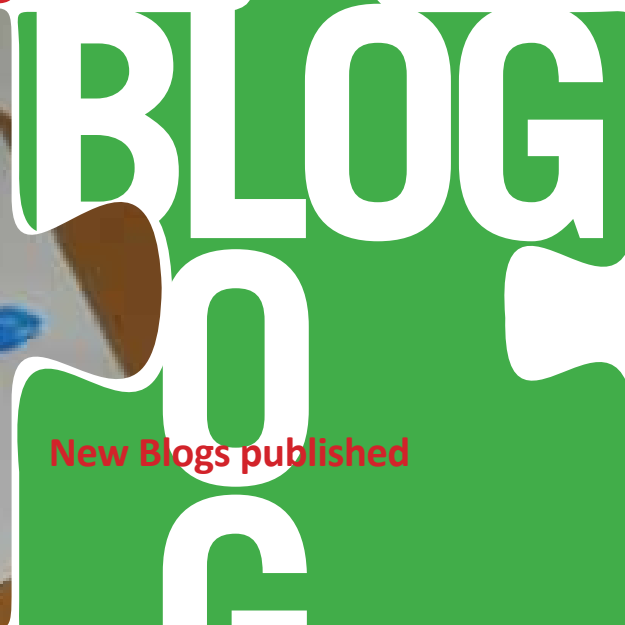
New Blogs published