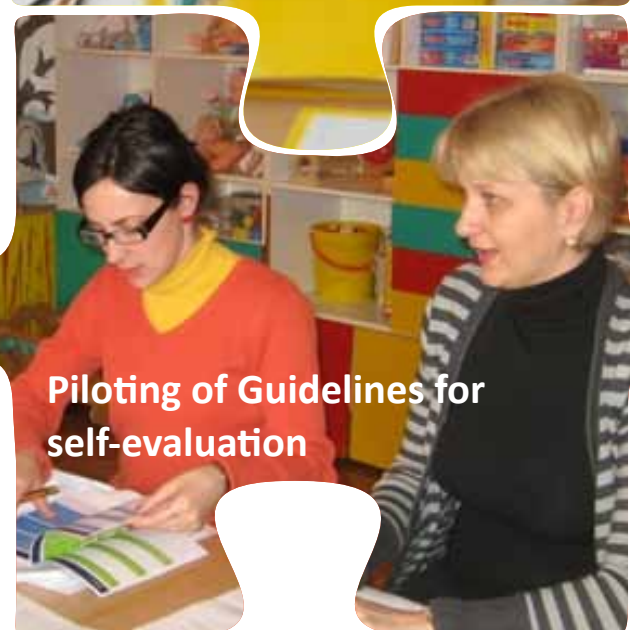
Piloting of Guidelines for self-evaluation